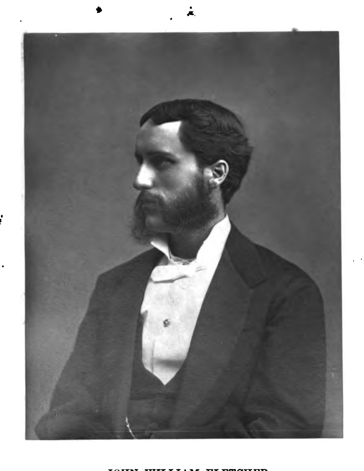
JOHN WILLIAM FLETCHER Taken in 1879.